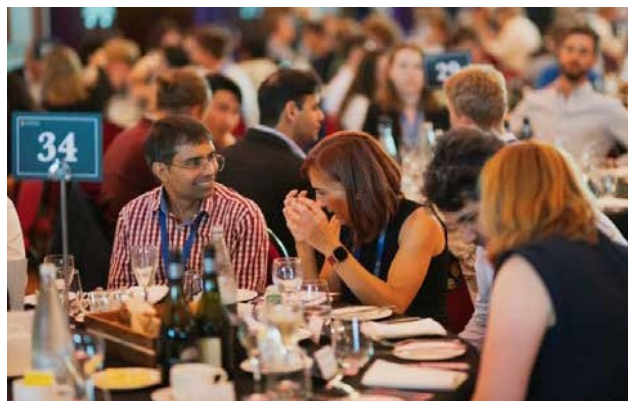
Above: Guests in conversation

United by seven iconic bridges across a bustling Quayside, Newcastle and Gateshead form a single, diverse and extremely vibrant visitor destination in the North East of England. Get ready to be charmed by the famous Geordie spirit in a city bursting with thriving nightlife, an award-winning restaurant scene, top-notch attractions and museums and places to stay which span comfortable affordability to four-star luxury.